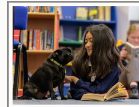
The RLT has a proven track record of making a difference, sustaining excellence and transforming lives.