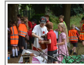
Our pupils have the opportunity to take part in numerous enrichment activities...