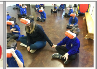
According to SIAMS, all of our schools are good or better! Some are excellent.