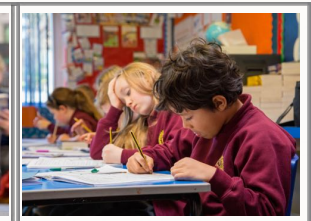
Every year our SATS results are well above National Averages at EYFS, KS1 and KS2.