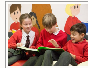
All pupils in The Rutland Learning Trust family attend a good or outstanding school - OFSTED.

We are a TEAM – a family of twelve schools. “Every part depending upon each other”